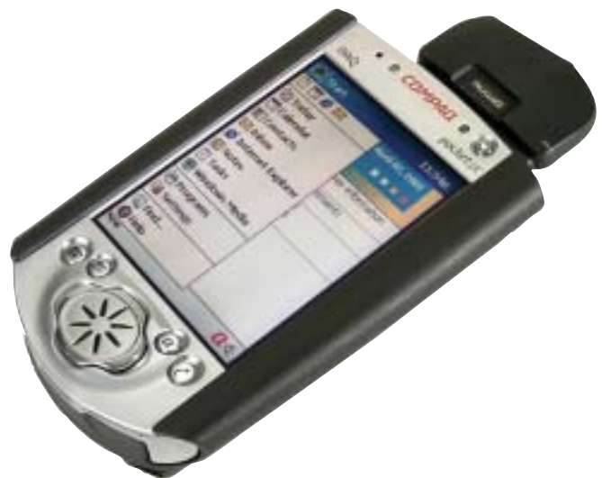
PDA with plug-in 3G Data Card.