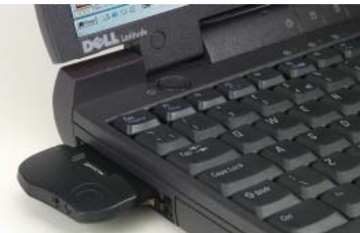
Laptop PC with plug-in 3G Data Card.

What's really exciting for operators, is the market for mobile office services is virtually untapped – it has not been captured by earlier or existing wireless technologies. Only 3G (e.g. UMTS and CDMA2000) can deliver the capabilities demanded by mobile professionals on the move: